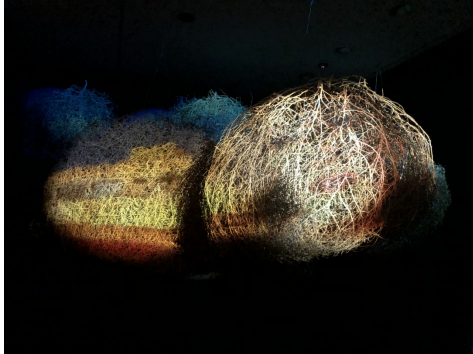
Guillermo Bert, "Tumble Dreams" (2018), digital projections on tumbleweeds

Black-and-white images of the site resemble survey photographs from the period that might have stoked speculation of resources and westward migration. While traces of these migrations seem subtle or hidden, they are portents of the rapacious extraction of resources and loss of life that eventually followed.