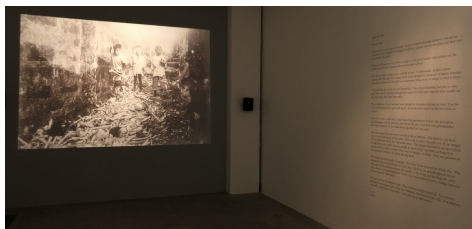
Installation view of Michelle Dizon, "The Archive's Fold" (2018)