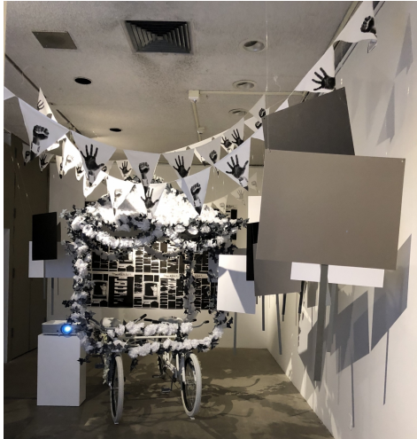
Installation view of Sandra de la Loza, “Pacific Electric Railway Strike of 1903” (2018), remade turn-of-the-century float, redacted poem silkscreen prints, reproduced photos and newspaper articles on foam core

The Barnsdall Art Park itself is the subject of “Aline’s Orchard,” an installation by artist Cassils that surrounds visitors with sounds and textures evoking olive groves and clandestine interactions. The park’s history as a queer cruising site is recalled not by sight, but by noises and smells made all the more vivid by darkness.