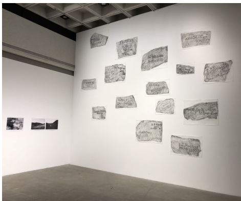
Installation view of Julie Shafer, “Parting of the Ways” (2018) rubbings (graphite, wax, paper) and photographs (inkjet print) from a location on the Oregon Trail (mid-to-late 1800s)

in black, leaving behind key phrases and words that paint an incomplete picture of the 700 Mexican workers who led the strike.